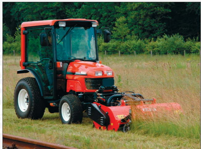
Hakotrac 3100 DA with front-mounted rotary mower 1.50 m width. A high performance for economic mowing of large external grounds. Optionally with various grass collection systems up to 1600 ltr. capacity.