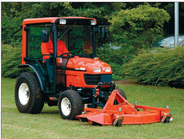
Hakotrac 3100 DA with front-mounted flail mower 1.40 m width. For quick and effective moving of large areas. Hydraulic side shifting allows the mower to reach out beyond the line of the vehicle to mow banks or hollows.

Alternative means of financing can be tailored to your requirements: Purchase, hire, leasing, rental, full service.